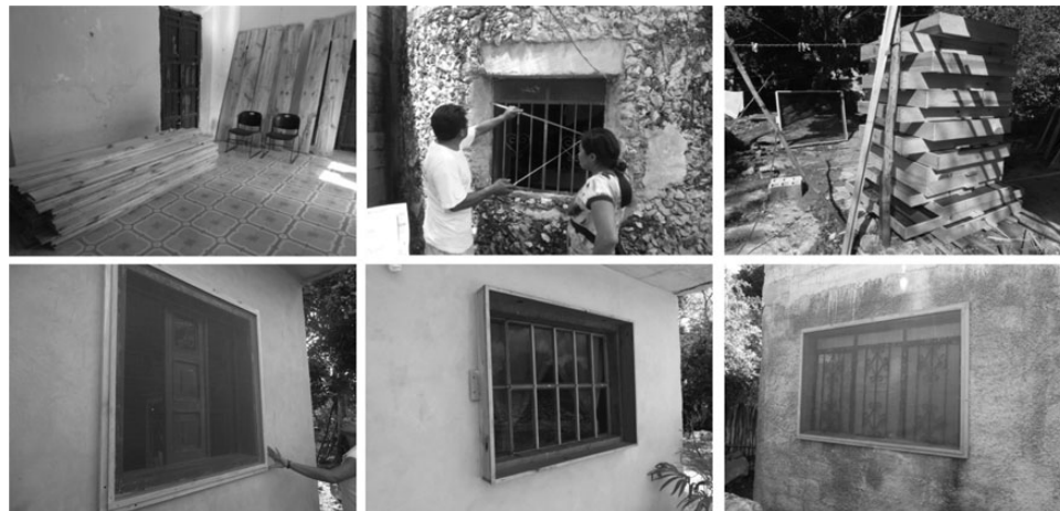
Figure 3. Manufacture and installation of insect screens for vector control. All screens were manufactured locally in the communities, using a high-quality fiber mesh with a wooden frame fitted to each bedroom window.

local situations and bypass obstacles. For example, community participation was limited in Sudzal following political tensions during local elections, as the project was perceived to be too strongly linked to the local government. Therefore we had to relocate community meetings in schools and the local health center to emphasize the non-political nature of the vector control intervention. Local governments were very supportive of the interventions, which they have readily incorporated as part of their social programs for housing improvement. For example, in Teya the mayor has agreed to fund the installation of extra window screens to large families who have additional bedrooms not covered by the project. Similarly, in Sudzal the mayor has agreed to provide