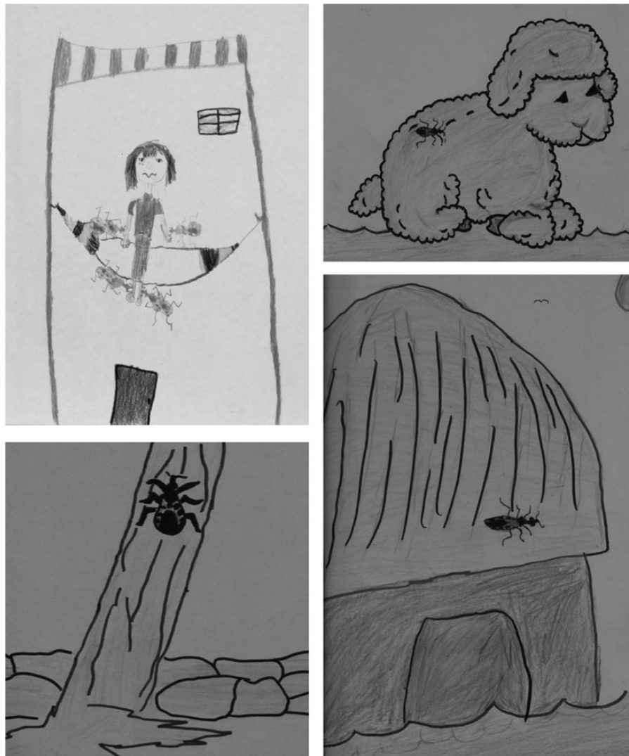
Figure 1. Children's perception of triatomines through drawings. Children appeared very knowledgeable about triatomines and their feeding habits, and should be engaged in education and awareness campaigns about Chagas disease and vector control.

of the different stakeholders about the intervention, and evaluating potential changes in their awareness of triatomines and Chagas disease and in their perception of the concept of vector control.